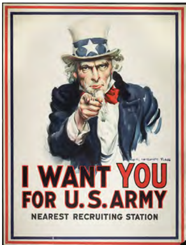
“I Want You” (1917) Artist: James Montgomery Flagg Printer: Leslie-Judge Co., New York Publisher: United States Army New York State Library, Manuscripts and Special Collections

Investigate the symbolism, text, emotion, color, lighting, and form when trying to determine the message!