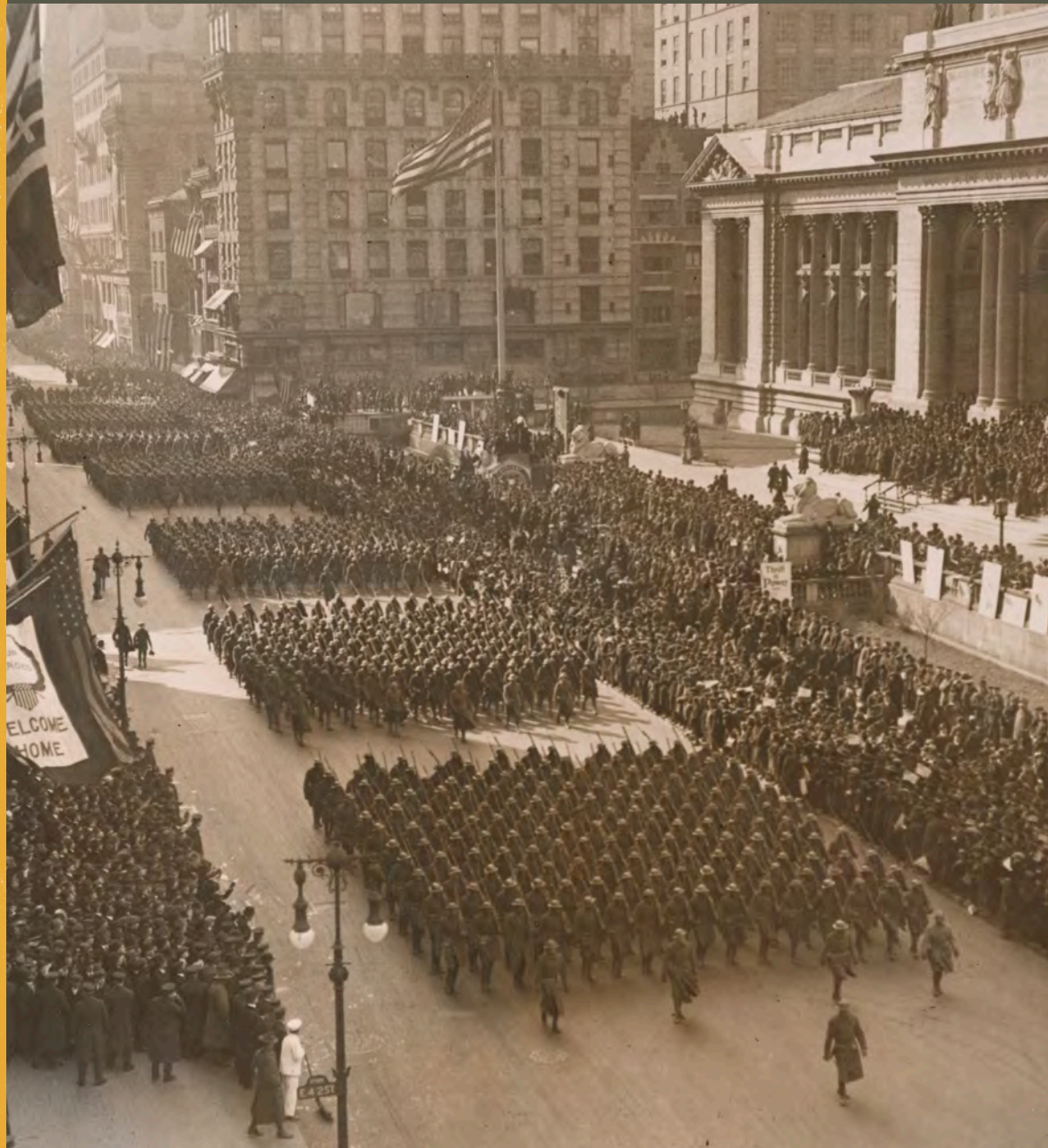
369th Infantry Regiment Homecoming Parade

This curriculum is aligned with the New York State P–12 Learning Standards.