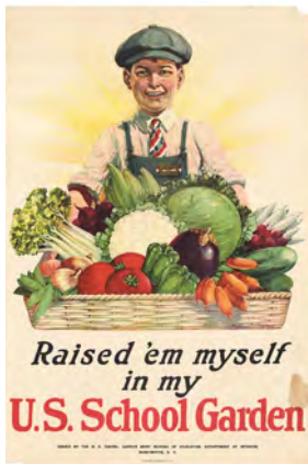
“Raised ‘em Myself” (1919) Artist: Anonymous Printer: American Lithographic Co., New York, NY Publisher: United States School Garden Army, Bureau of Education, Department of the Interior New York State Museum Collections, H-1975.85.4