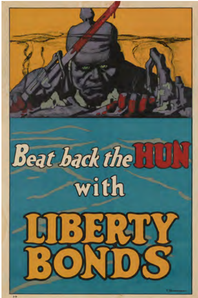
"Beat Back the Hun with Liberty Bonds" (1918)

Back in the classroom, have the students answer the following questions in their own words about the selected images below: