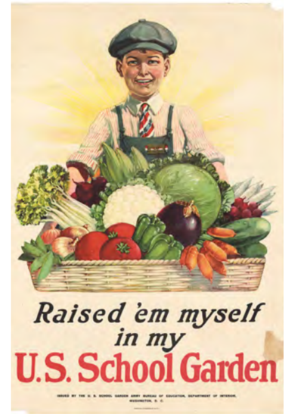
“Raised ‘em Myself” (1919) Artist: Anonymous Printer: American Lithographic Co., New York, NY Publisher: United States School Garden Army, Bureau of Education, Department of the Interior New York State Museum Collections, H-1975.85.4