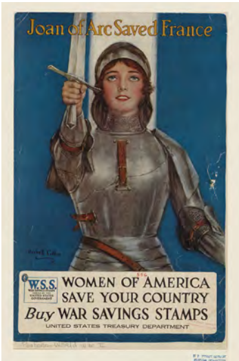
“Joan of Arc Saved France” (1918)