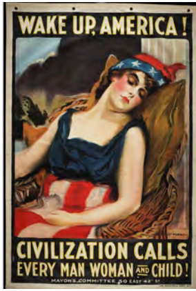
“Civilization Calls” (1917) Artist: James Montgomery Flagg Printer: Hegeman Print, New York, NY New York State Library, Manuscripts and Special Collections