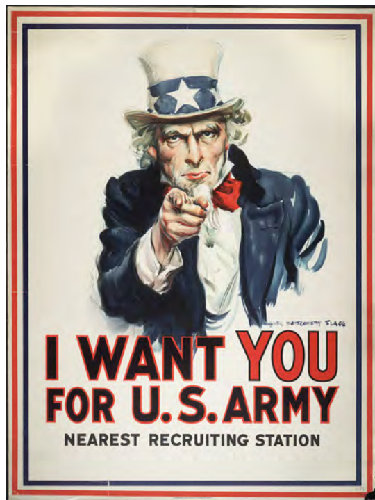
"I Want You" (1917) Artist: James Montgomery Flagg Printer: Leslie-Judge Co., New York Publisher: United States Army