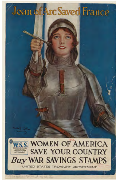
"Joan of Arc Saved France" (1918)

New York State Library, Manuscripts and Special Collections