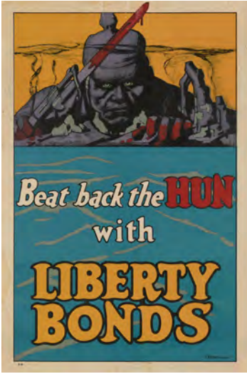
“Beat Back the Hun with Liberty Bonds” (1918)