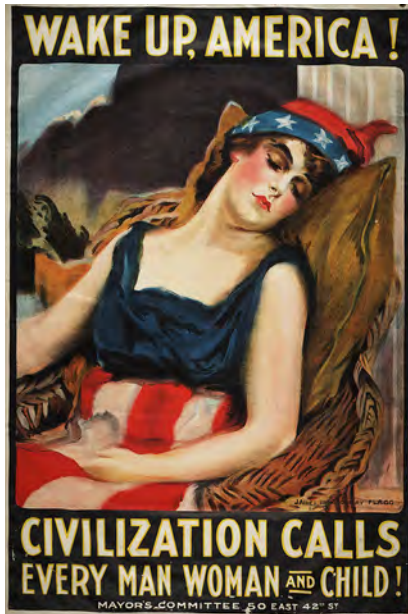
“Civilization Calls” (1917) Artist: James Montgomery Flagg Printer: Hegeman Print, New York, NY New York State Library, Manuscripts and Special Collections

Then contrast the following posters, answering the questions below: